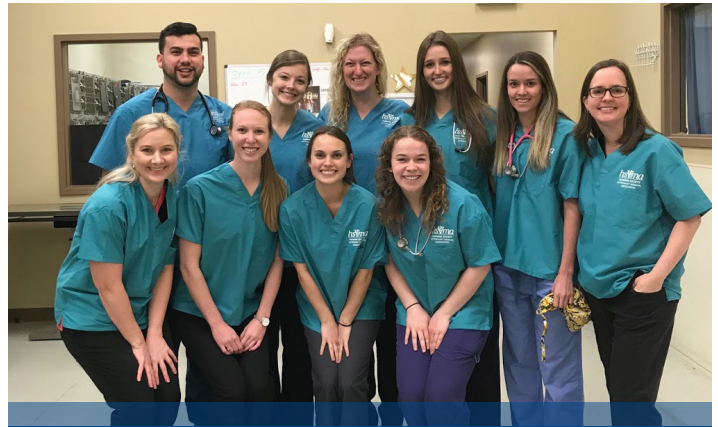
Auburn University vet students and clinicians at World Spay Day clinic.