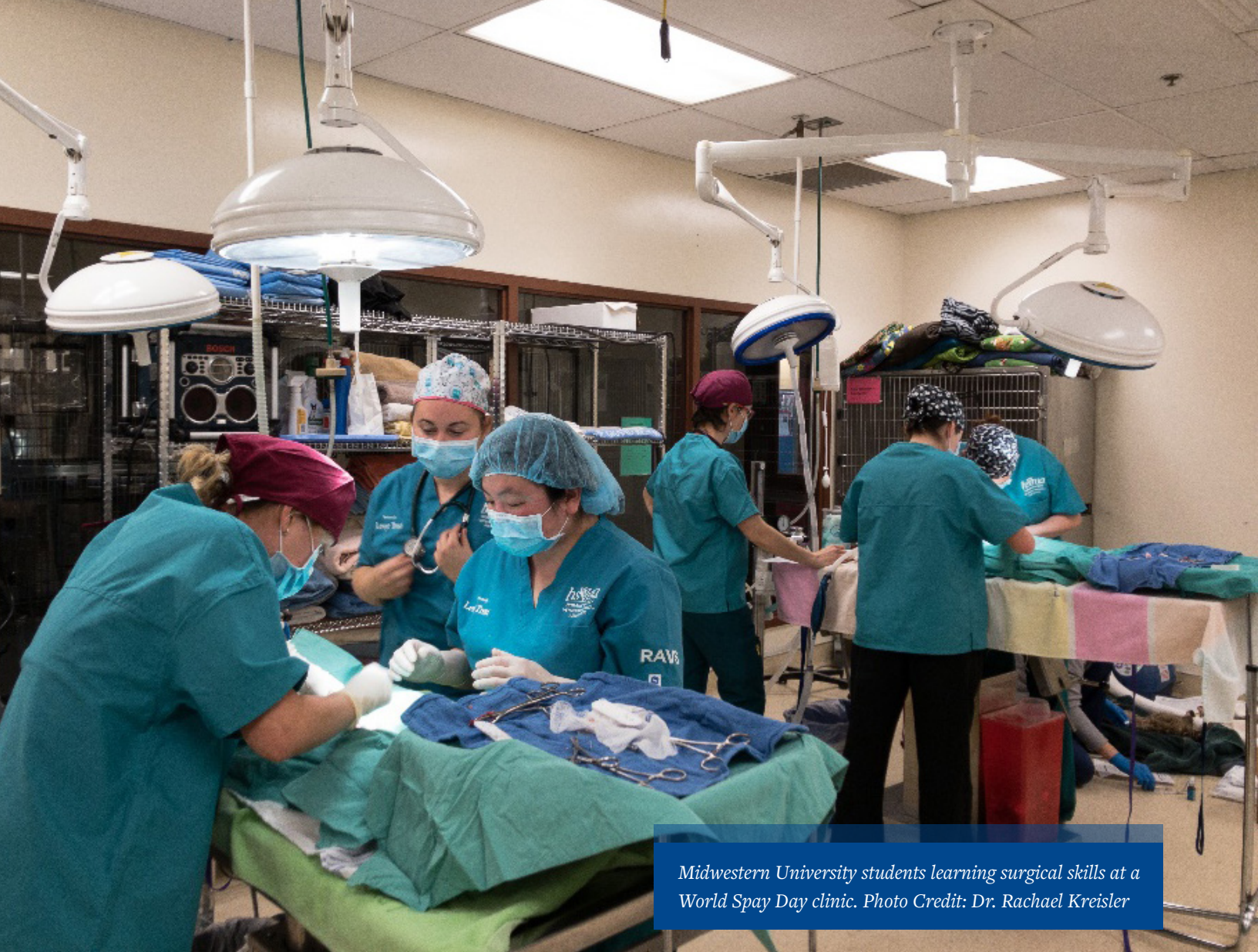
Midwestern University students learning surgical skills at a World Spay Day clinic.