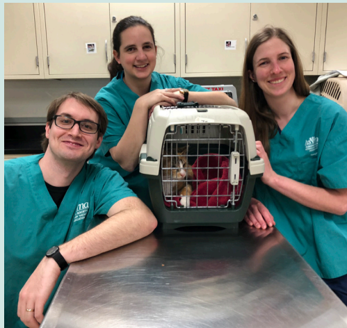
HSVMA veterinary student members from the University of Wisconsin participate in an HSVMA-sponsored World Spay Day event at the school.