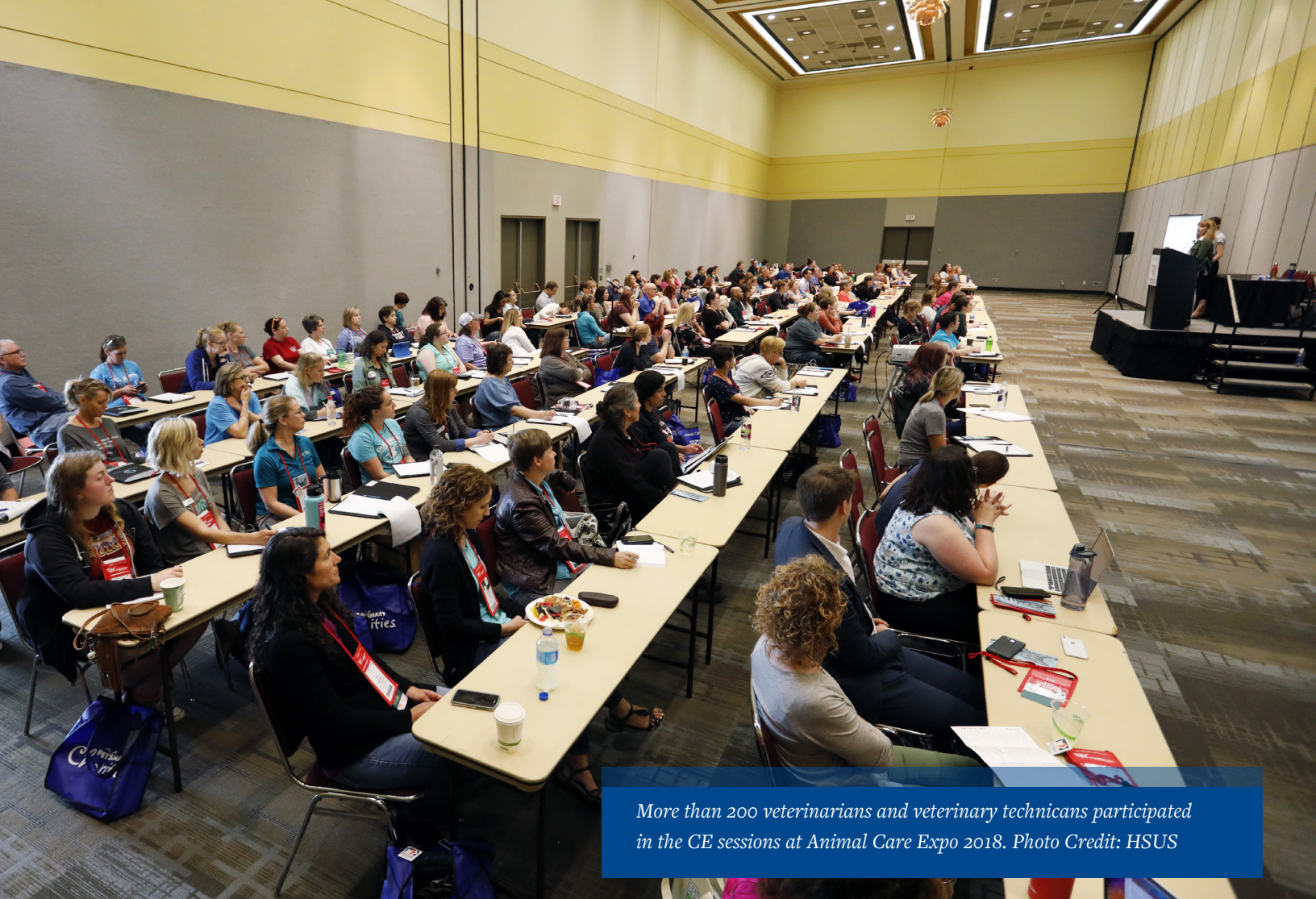
More than 200 veterinarians and veterinary technicians participated in the CE sessions at Animal Care Expo 2018.