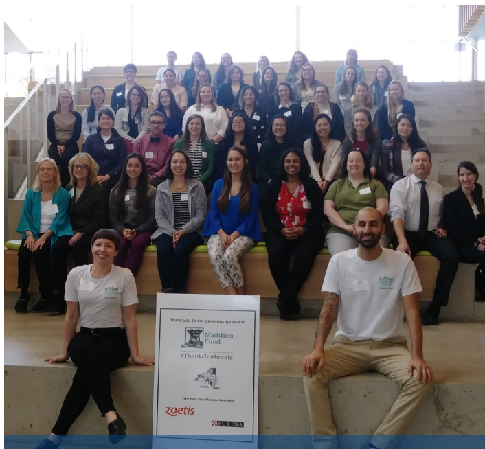
Attendees of the 2018 Animal Welfare Symposium at Cornell University College of Veterinary Medicine.

In October, HSVMA hosted the fourth annual Animal Welfare Symposium at Cornell University College of Veterinary Medicine. Experts spoke on topics such as recognizing and reporting animal cruelty, street dog medicine, controversies in wildlife research, management of global dog populations and community cat management. Attendees had the option to participate in a RAVS suture lab and in a Street Dog Coalition clinic to serve pets of the homeless.