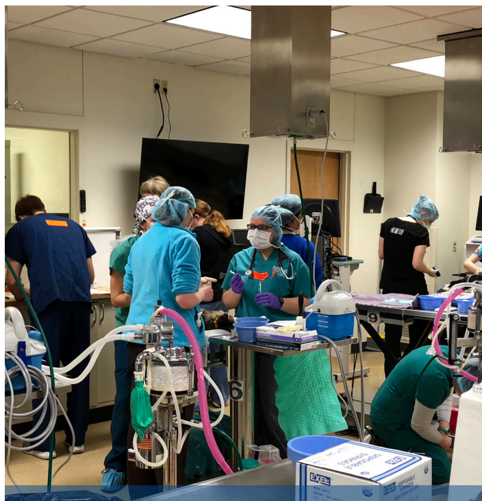
University of Wisconsin vet students in action during Spay/Neuter Awareness Month.