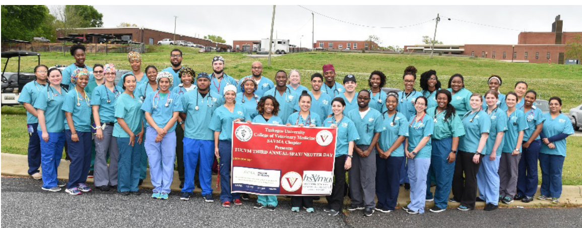
Vet students at Tuskegee University participating in World Spay Day.