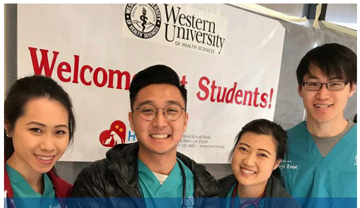
Western University HSMA chapter officers at World Spay Day clinic.