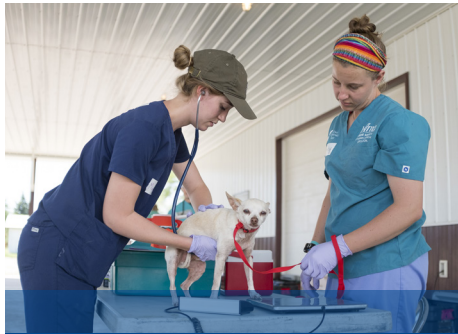
Volunteer veterinary students examine a dog during a RAWS clinic on the Cheyenne River Indian Reservation.

wellness and emergency care for more than 8,000 animals every year. The clinics offer rewarding educational experiences for hundreds of veterinary students annually and give dedicated professional volunteers who generously share their time and expertise the opportunity to receive up to 30 hours of RACE-approved continuing education credit. www.ruralareavet.org